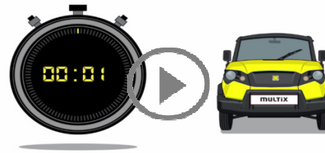
Space Adaptability Film