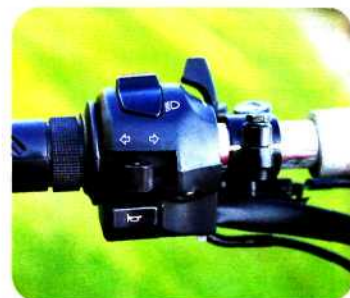
• Clip-on bars accommodate typical Royal Enfield switchgear.