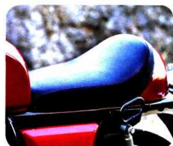
● The slim, sporty single saddle shows off neat body colour stitching.