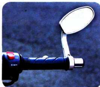
• RE crafted mirrors give good visibility despite being small.